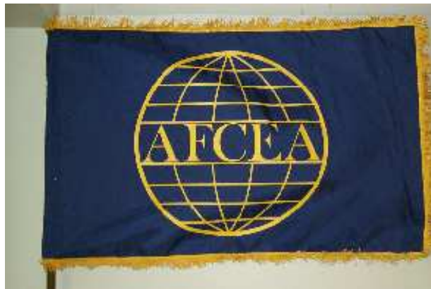
Figure 2: Official AFCEA International Flag

Section 2: AFCEA International Flag. The official AFCEA Flag shall consist of the International Logo, executed in gold, superimposed upon a field of blue fabric. (See figure 2 below)